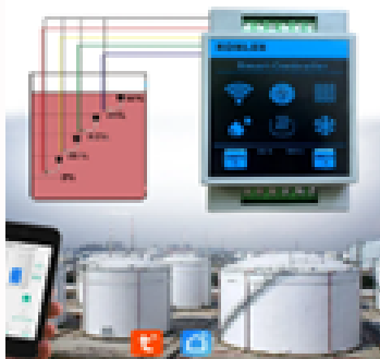
Liquid/Water/Petrol/Diesel/Fuel Level Cont

Door and window sensors are key components of any home security system. They detect unauthorized entry or attempted break-ins by alerting homeowners when doors or windows are opened or closed.